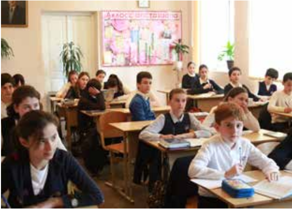
School class in Abkhazia