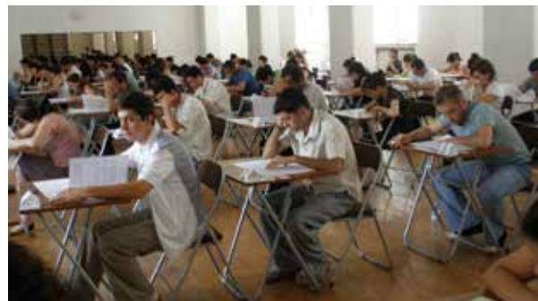
Students sitting exams

Less social and demographic research is available with regard to the Abkhazian context. 45.9% of the population of Abkhazia is under 34 years old according to the Statistics Department