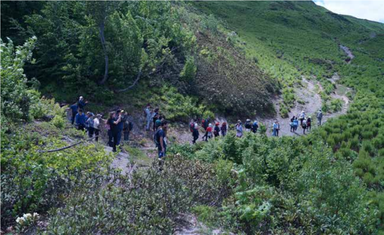
Participants at a youth summer camp in Abkhazia

ensure our youth can travel to other countries to gain such learning experiences.