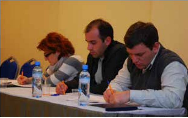
Young Georgians engaging in discussions about conflict

that would not occur to the older generation. The youth have potential. It is necessary to ensure that the initiative shown by youth has a response. Young people should be given the opportunity to interact with all the government authorities. (Abkhaz participant in Sukhum/i)