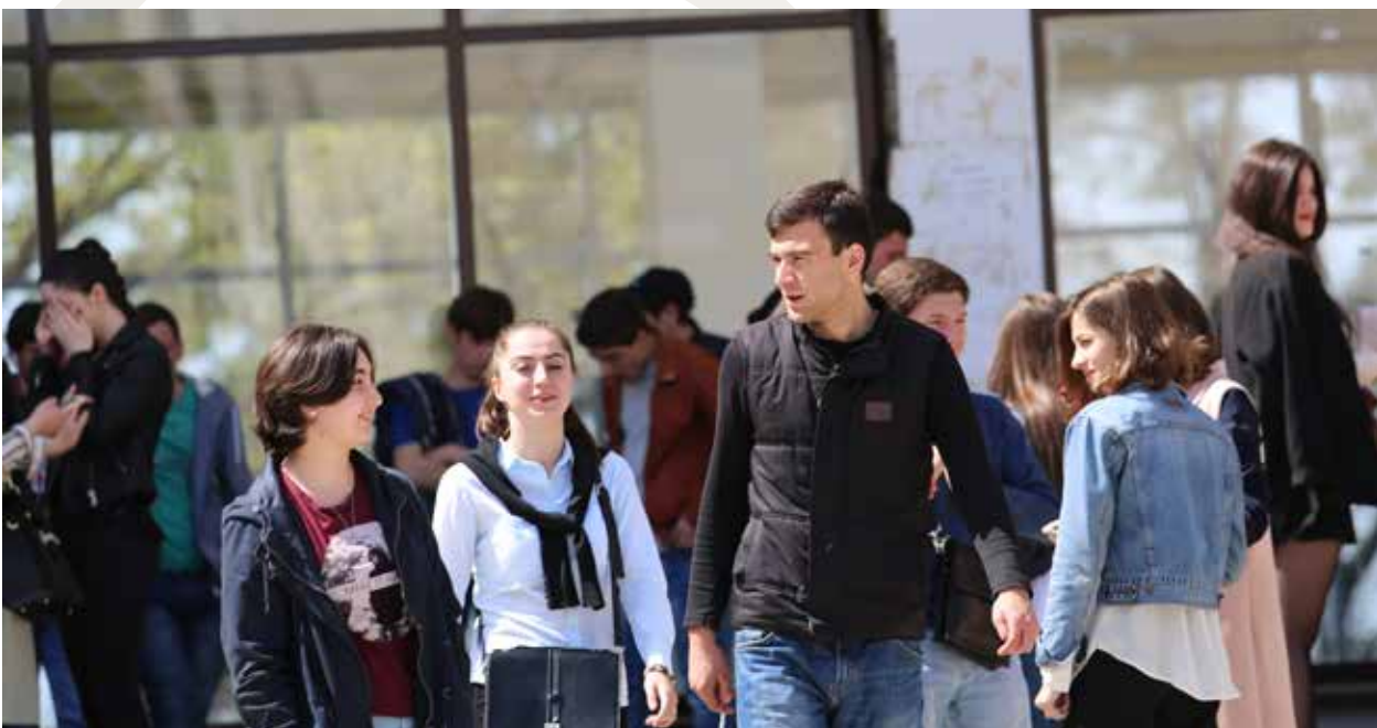
University students in Abkhazia

Immediate economic concerns often take priority over political engagement: