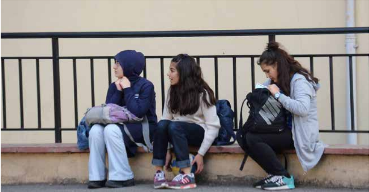
Students in Tbilisi