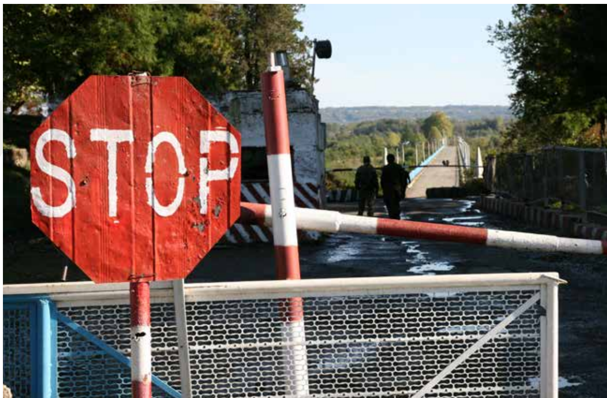
Georgian-Abkhaz crossing point

The majority of focus group discussions across the board confirmed that the societies continue to struggle with managing diversity in