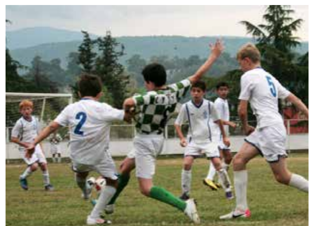
Boys playing football

In our society it is taken for granted that young people always rely on their family. And I am convinced that what also holds us back is the fact that in each family there is a successful relative who supports the whole extended family financially. And while this phenomenon exists in our society, the concept that people need to do things for themselves will not be accepted. People do not rely on themselves, but only on their families and relatives. (Abkhaz participant in Gudauta)