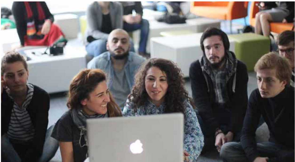
Young journalists at a training course

The youth are the part of our society which are open-minded and capable. When they dedicate themselves to solving problems, they have ideas